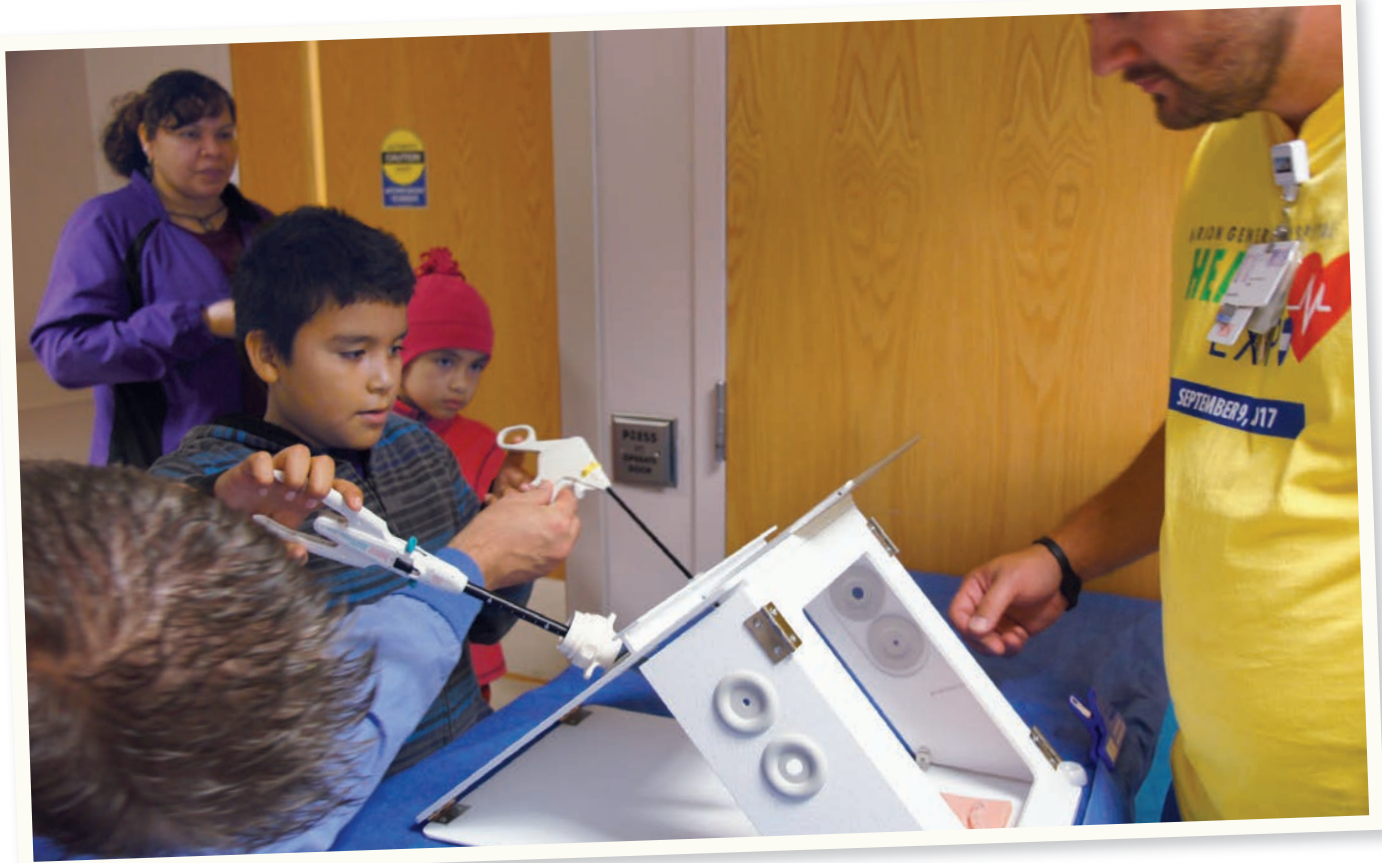
Above: A child uses an iPad demonstrating laparoscopic suturing during a tour of the Surgery Center at the MGH Health Expo.

Types of surgeries include general surgery, urology, otolaryngology (ENT), plastic surgery, orthopedics, gastroenterology, gynecology, pediatric dentistry, oral surgery and podiatry.