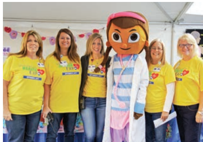
Team members from the Physicians Practice Management office and Doc McStuffins.