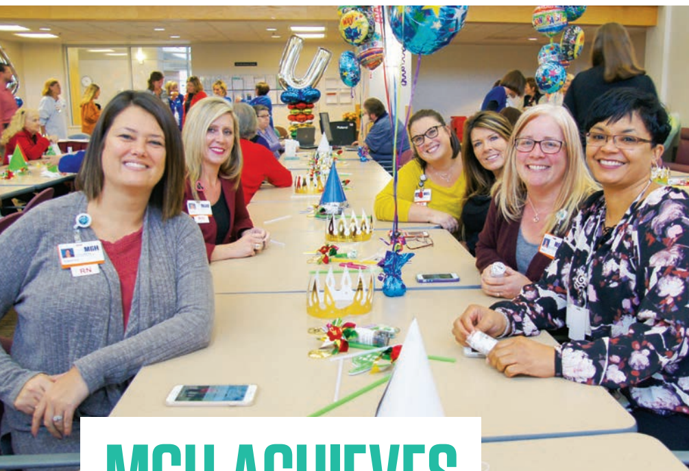
Marion General Hospital employees celebrate the hospital's Magnet recognition.