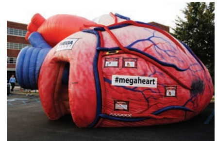
The inflatable mega heart exhibit, an educational tool.